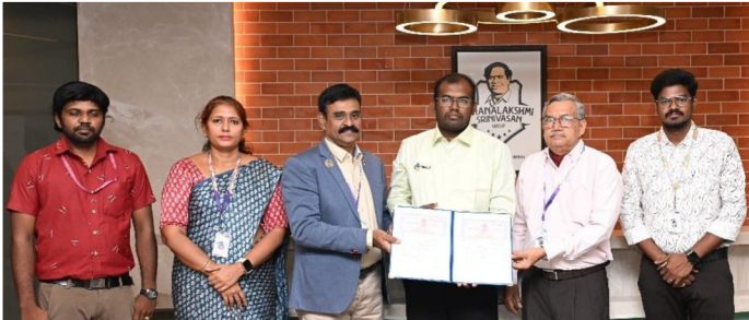
MoU Signed Dhanalaxmi srinivasan university