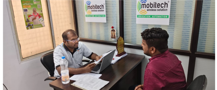
Walkin drive Anathapur Office