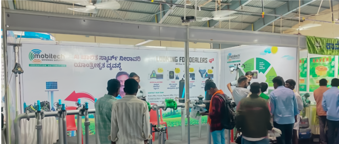
Krishi Mela 2025 GKVK, Dharwad - Karnataka